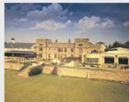
De Vere Slaley Hall