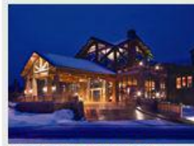
Westgate Park City Resort and Spa