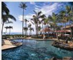
Marriott's Waiohai Beach Club